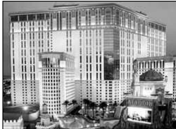
The 2006 Healthcare Seminar is scheduled at the Aladdin Resort and Casino in Las Vegas. Make your reservations by Oct. 9 to secure the best room rate.